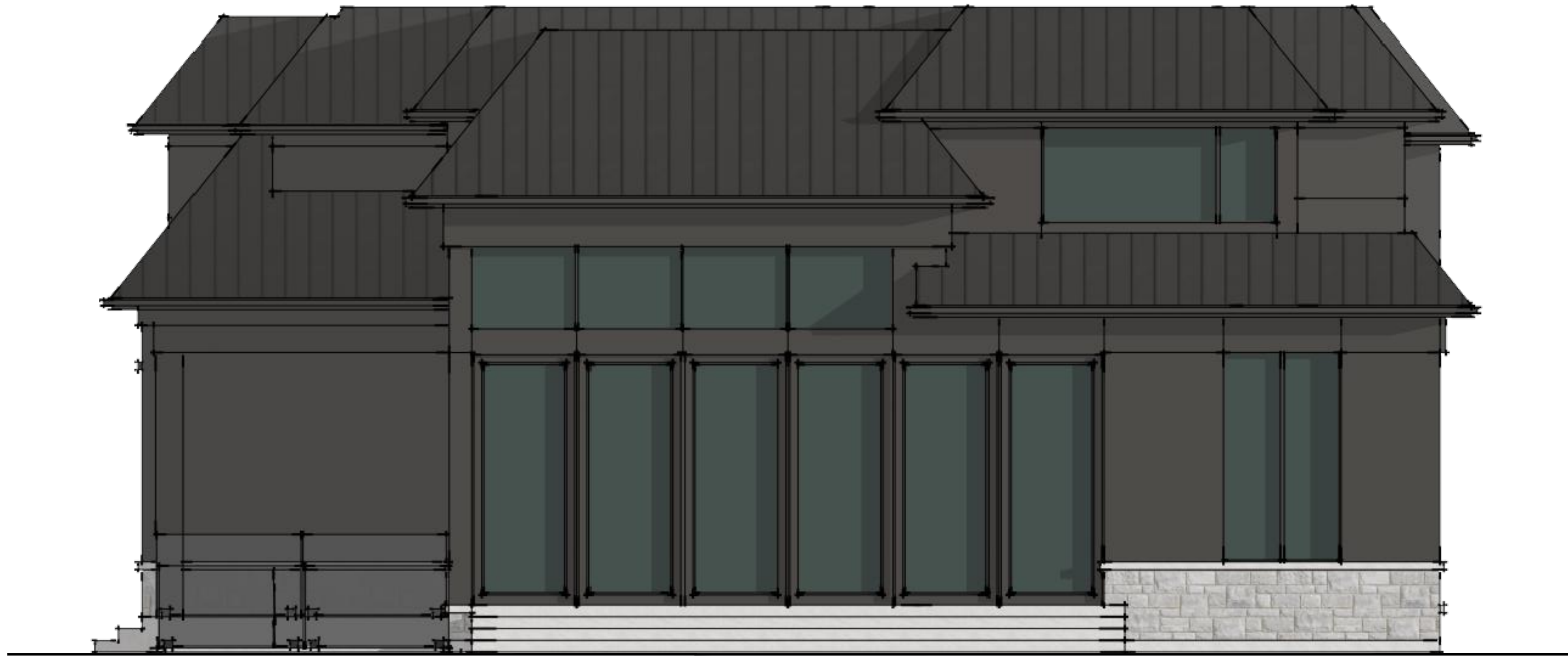
1/8"=1'-0" REAR ELEVATION