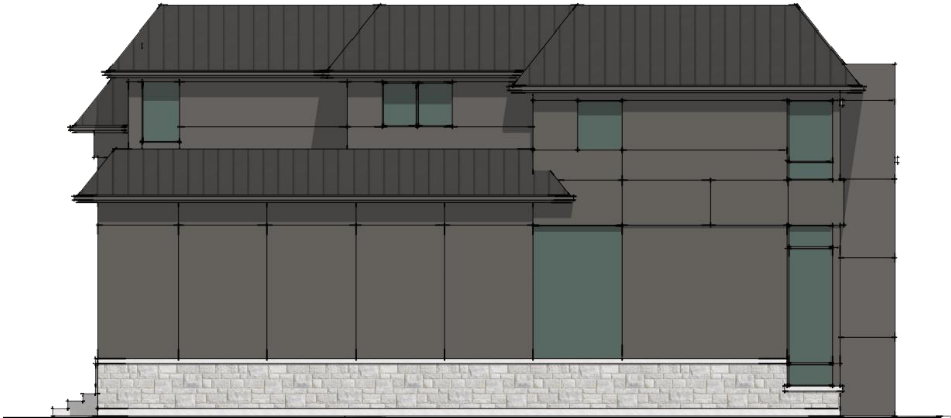
1/4" = 1'-0" LEFT ELEVATION