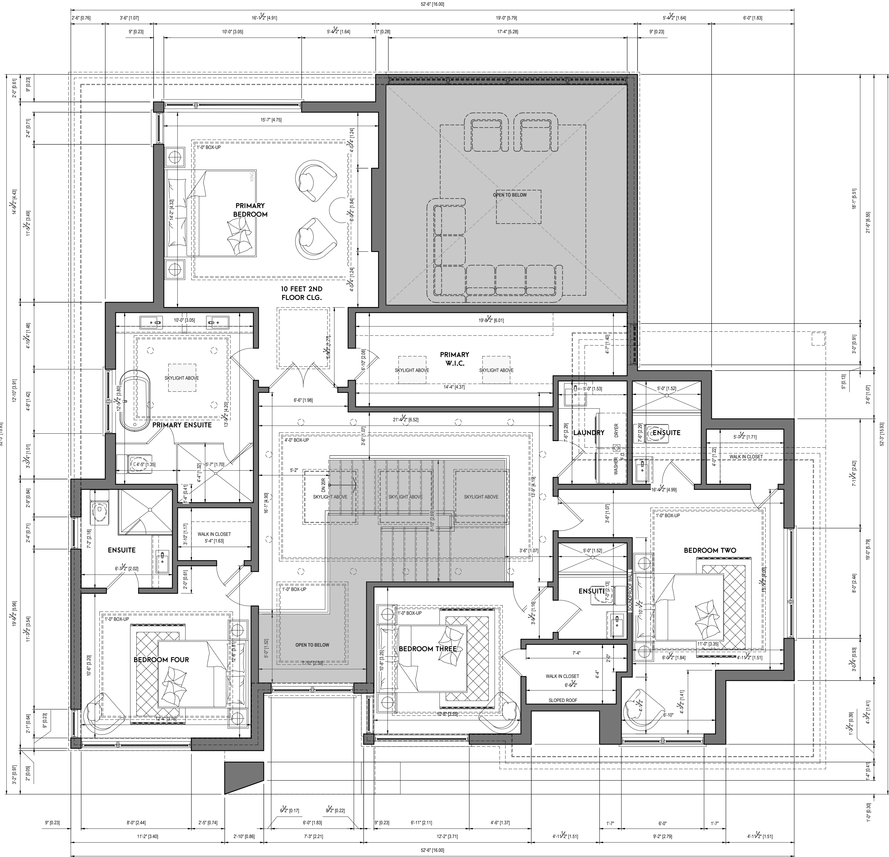
1/8"=1'-0" SECOND FLOOR PLAN