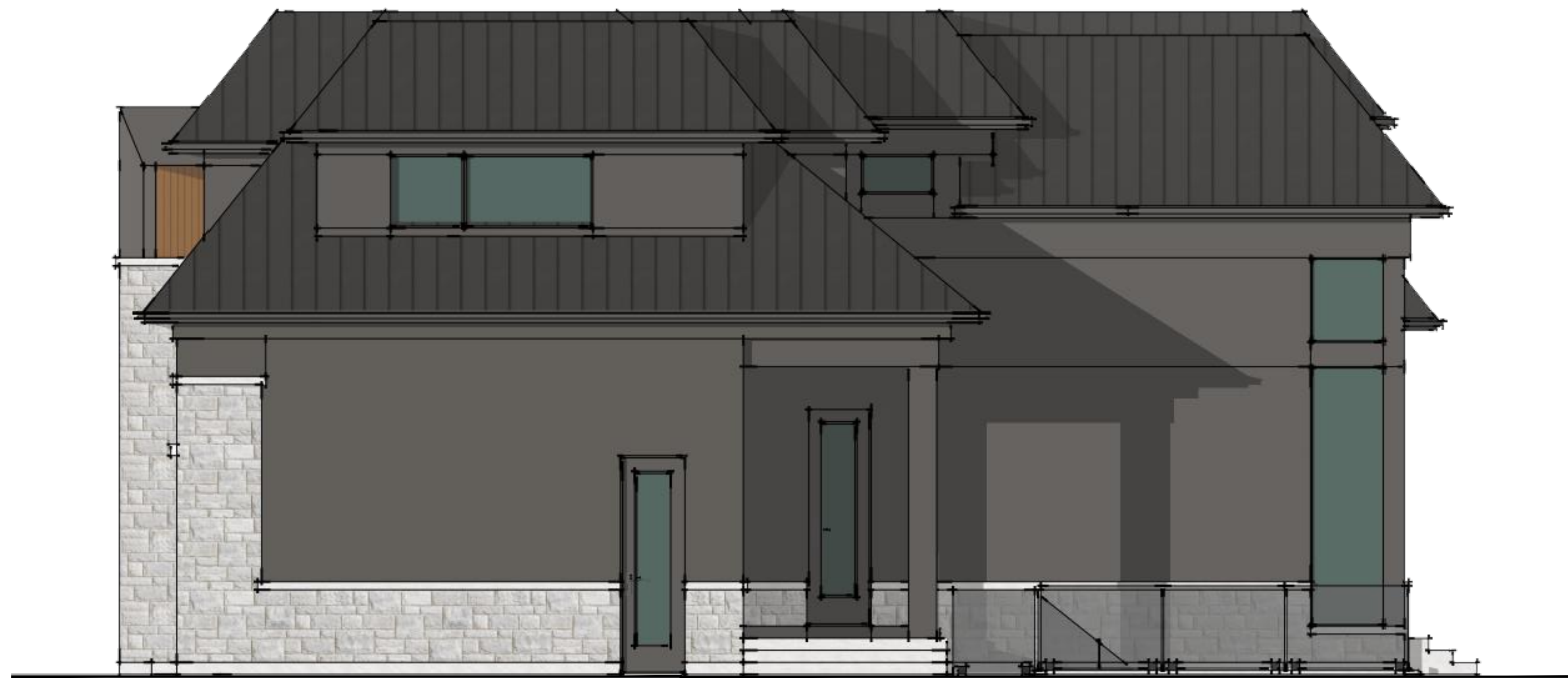
1/4"=1'-0" RIGHT ELEVATION