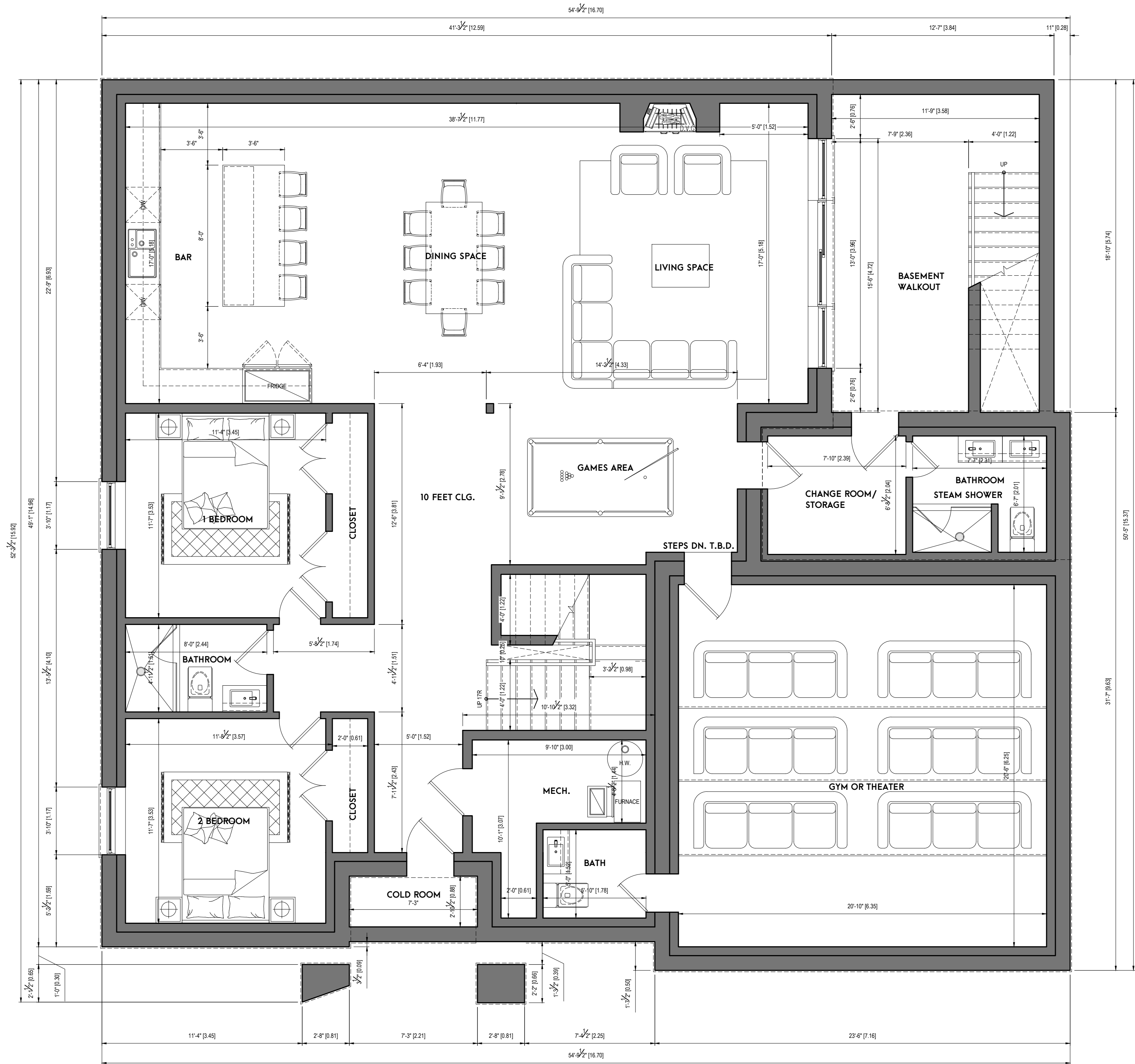
1/8"=1'-0" BASEMENT FLOOR PLAN